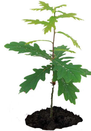
3. Young Oak Tree