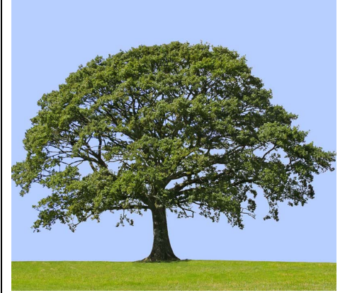
4. Grown Oak Tree